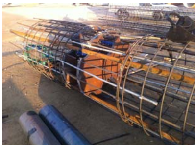
O-cell Cage preparation