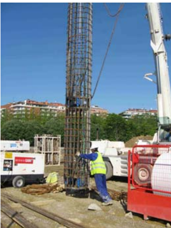
Multi-level cage layout before installation

The pile bore was constructed 17m long and one O-cell level was set very close to the toe to measure the end bearing properties. The second upper level was placed exactly 2.5 metres above this level. A zero shear sleeve section was inserted into the top section of the pile to give a second 2.5 metre section between the upper O-cell level and the zero shear zone. An arrangement of two 330 mm diameter O-cells at each level was chosen. These provided a 7.8 MN loading to the base and to the rock sections below and above the upper O-cell levels. It was considered that this loading should provide sufficient capacity to obtain ultimate values of both the end bearing resistance and skin friction in the rock.