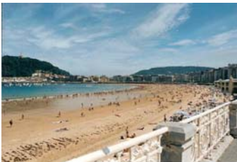
Playa De La Concha, San Sebastian

In order to further research on pile design in rock, Professors Olalla and Serrano have been investigating the behaviour of the shaft friction of piles in rock. The research was planned to check a new empirical design theory with a secondary objective to determine the pile end bearing resistance. To obtain useable data for this research, controlled loading of a fixed shaft length in the rock was required. Two levels of O-cell were placed so that the mid-section was a known length and therefore the skin friction area was readily quantifiable.