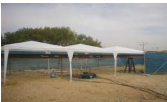
Bi-directional test in progress

Situated on an artificial peninsular into the River Ebro, the test site was part of a very prestigious and technically challenging pedestrian bridge project. Architect Zaha Hadid and Arup partnered to design and oversee construction of this unique bridge.