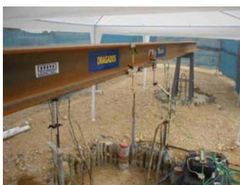
Test pile head and reference beam