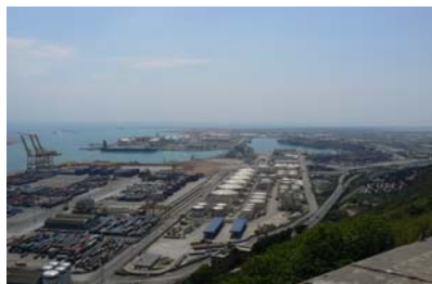
Port of Barcelona

Project: Terminal Muelle Prat, Port of Barcelona Location: Barcelona, Spain Client: Ferrovial Agroman S.A. & Comsa S.A. Project Description: Port Redevelopment