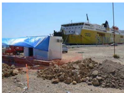
Pile testing on reclaimed land