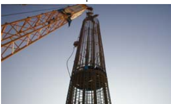
Installation of O-cell arrangement within pile cage