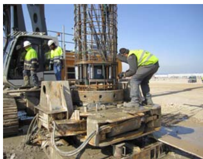
Installation of reinforcement