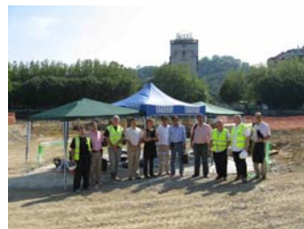
University of Madrid, Rodeo Kronsa and Fugro Loadtest personnel.

The pile was loaded in two stages, the initial stage loading the toe of the pile using the upper section of the pile as resistance. Once the toe of the pile moved downwards, the bottom O-cell level provided zero resistance to downward movement when the upper level of O-cell was loaded in the second stage. Stage one loading provided a total maximum of 8.5 MN to the base, but the ultimate end bearing had not been mobilised sufficiently to fully characterise the base behaviour. Loading of the upper O-cell level was then performed, loading an independent section of pile above and below the O-cell arrangement of 2.5 metres. At the maximum rated O-cell capacity, the rock still held steady and even with increasing the pressure by an additional 50%, the friction could not be fully mobilised in the rock; achieving less than 1.5 mm movement above and below the upper O-cell level.